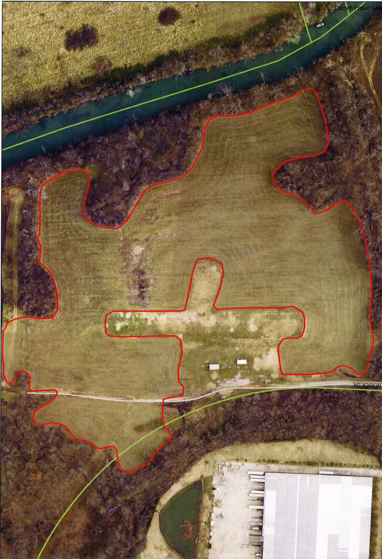
Combs Park Approximately 17 acres