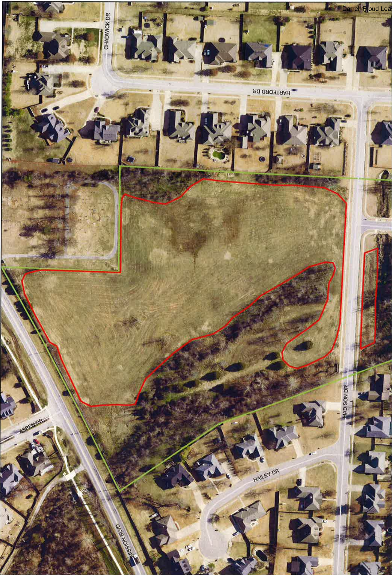
Madison Natural Area Approximately 7 acres