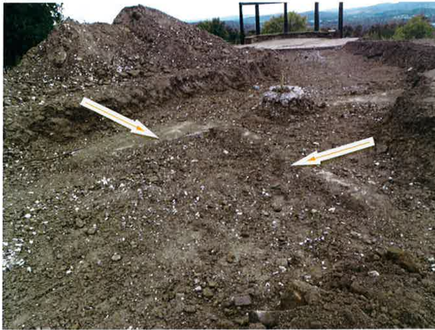
Existing Concrete Footing Encountered during Sidewalk Construction